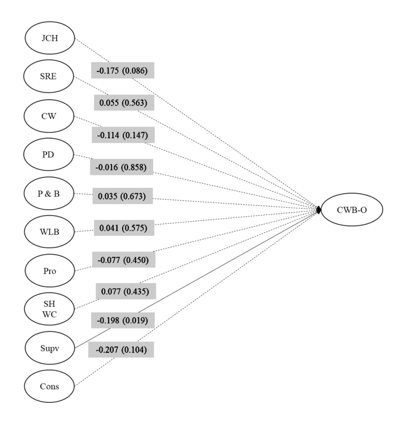
Figure 2. Role of QWL on CWB-O.

or, i.e., behavior that is not in accordance with norms/rules (formal/informal), the authors still consider the above behavior as CWB.