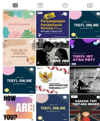
Figure 2. Example of social media marketing conducted by the course

The type of digital marketing used by the course is social media marketing, specifically instagram, since most of the customers of the course are university students and some school students, as this generation mostly use and have their own social media. Instagram marketing is able to attract people who are online to visit the instagram of the course and then take a look at the content. The content consist of some information related to the course program (opening of the course, test program), tips and trick in learning foreign languages, common grammar mistakes, and many more. This content can make people who are interested on it, finally follow the instagram account of the course. Indeed, these followers are prospect customers who are able to get notification whenever the course uploads new content in the instagram.