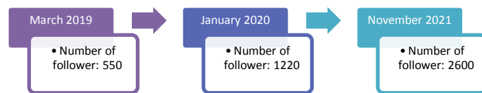
Figure 3. Number of followers that can be reached

This instagram promotion is effective since whenever public especially followers access their instagram account, they will be able to see the content of the course. If they are interested to join or ask further information, all they need is just click the link and they will be connected with the administration staff of the course. Indeed, the lockdown condition is no longer problem since the course now is able to engage with customers wherever the customers are.