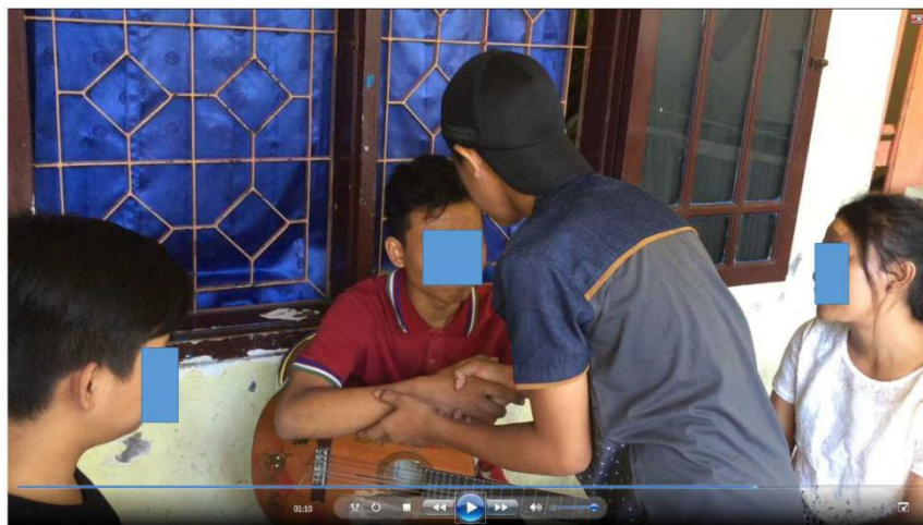
Figure 1. A screenshot from the participants' public service advertisement, where the bully apologizes to the blind person.

of a friend of his, who can play guitar very well and has generously taught him to play the guitar. When he enters the house, the bully is surprised, because the one who can play the guitar very well is the blind person he previously pushed to the ground. The bully then apologizes, and realizes that he should not undermine people with diffability, because they may have other abilities he does not possess. The scene of the public service advertisement is shown in Figure 1.