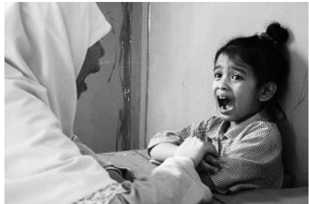
Figure 2. Eye contact therapy